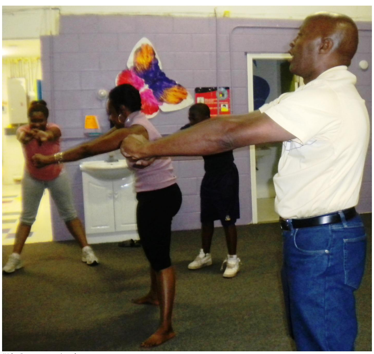
#10 - Parent exercise class