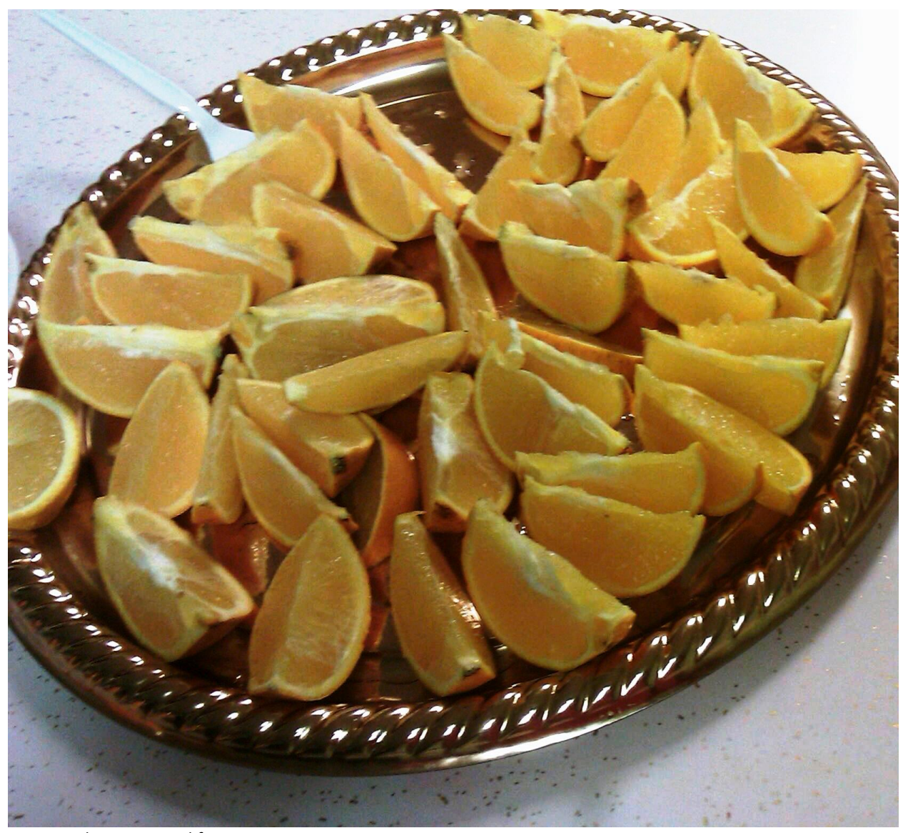
#12 – Student-prepared fruit tray