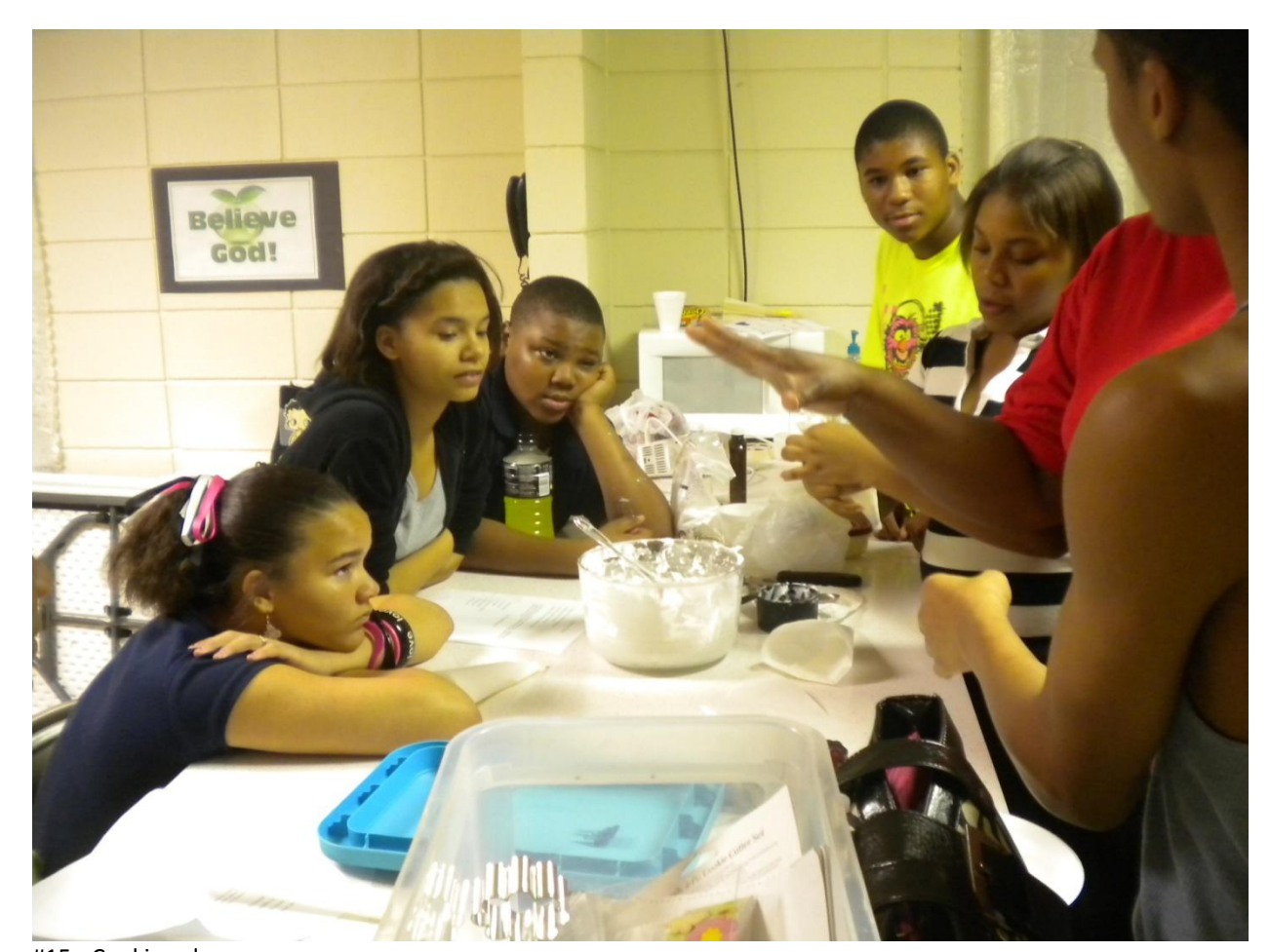
#15 - Cooking class