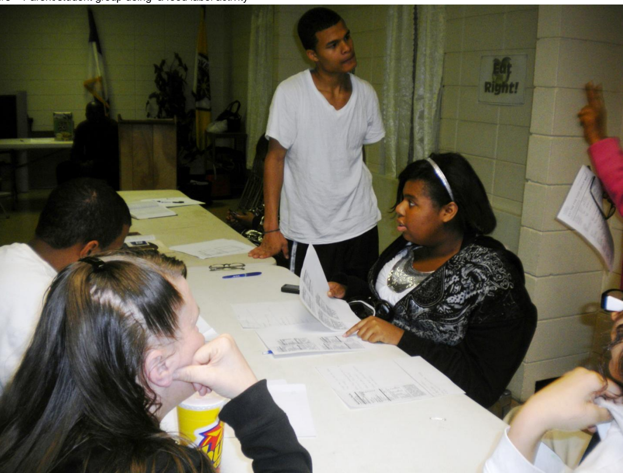
#8 - Parent/student group doing a food label activity