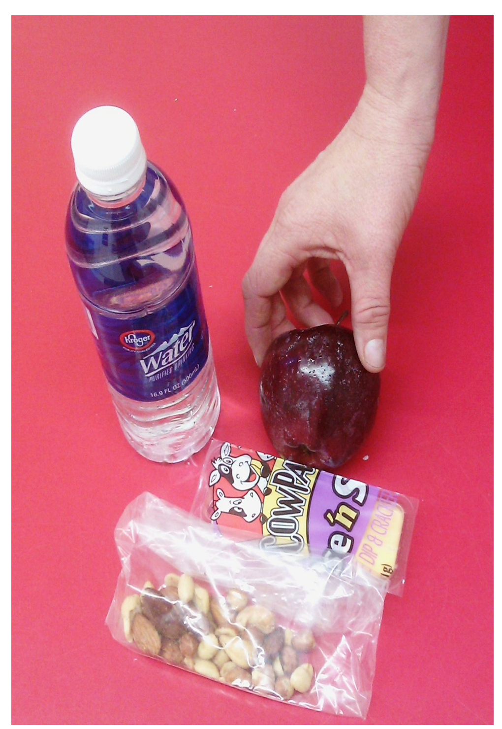
#11 – A parent preparing a snack