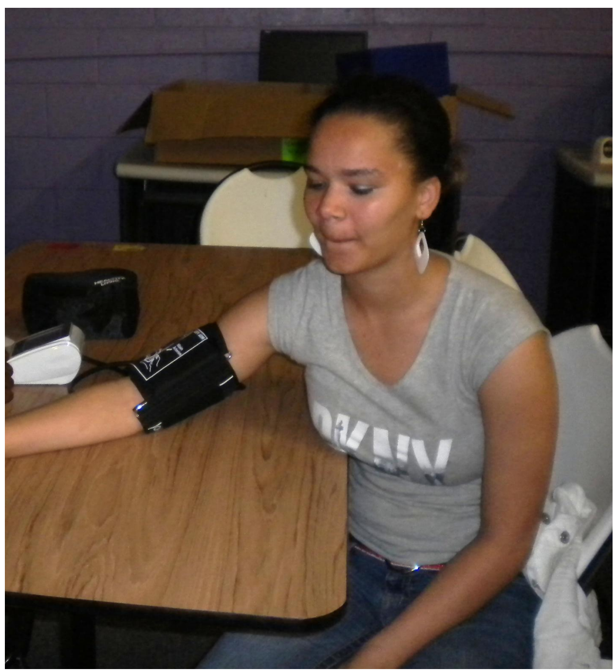
#4 – Student getting BP measured