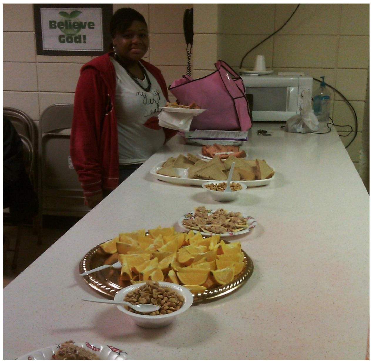
#13 Student at table of snacks she prepared