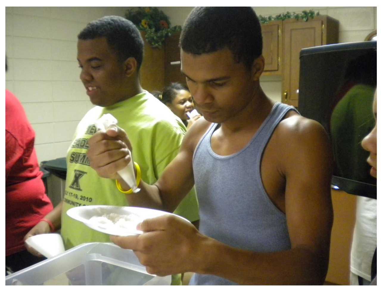
17- Cooking class