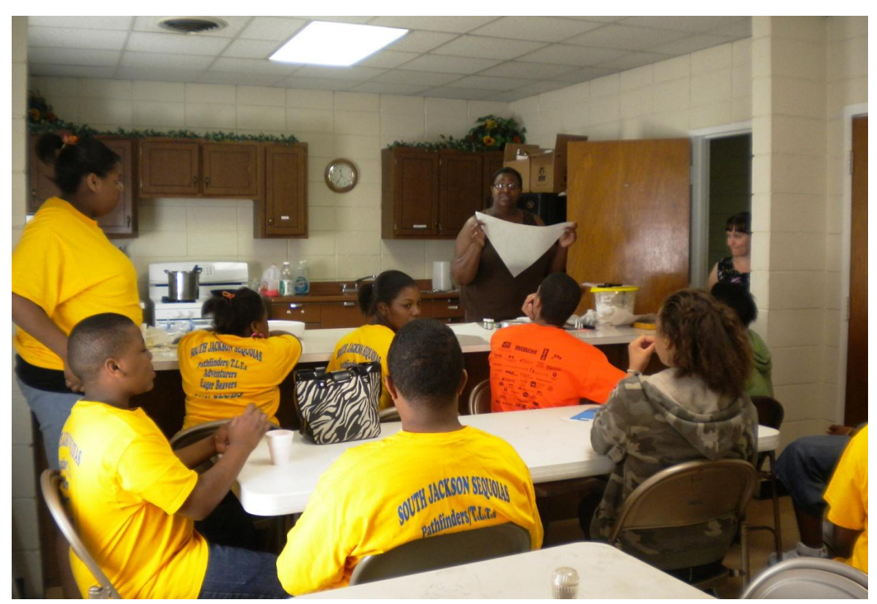
#14 – Breadmaking class