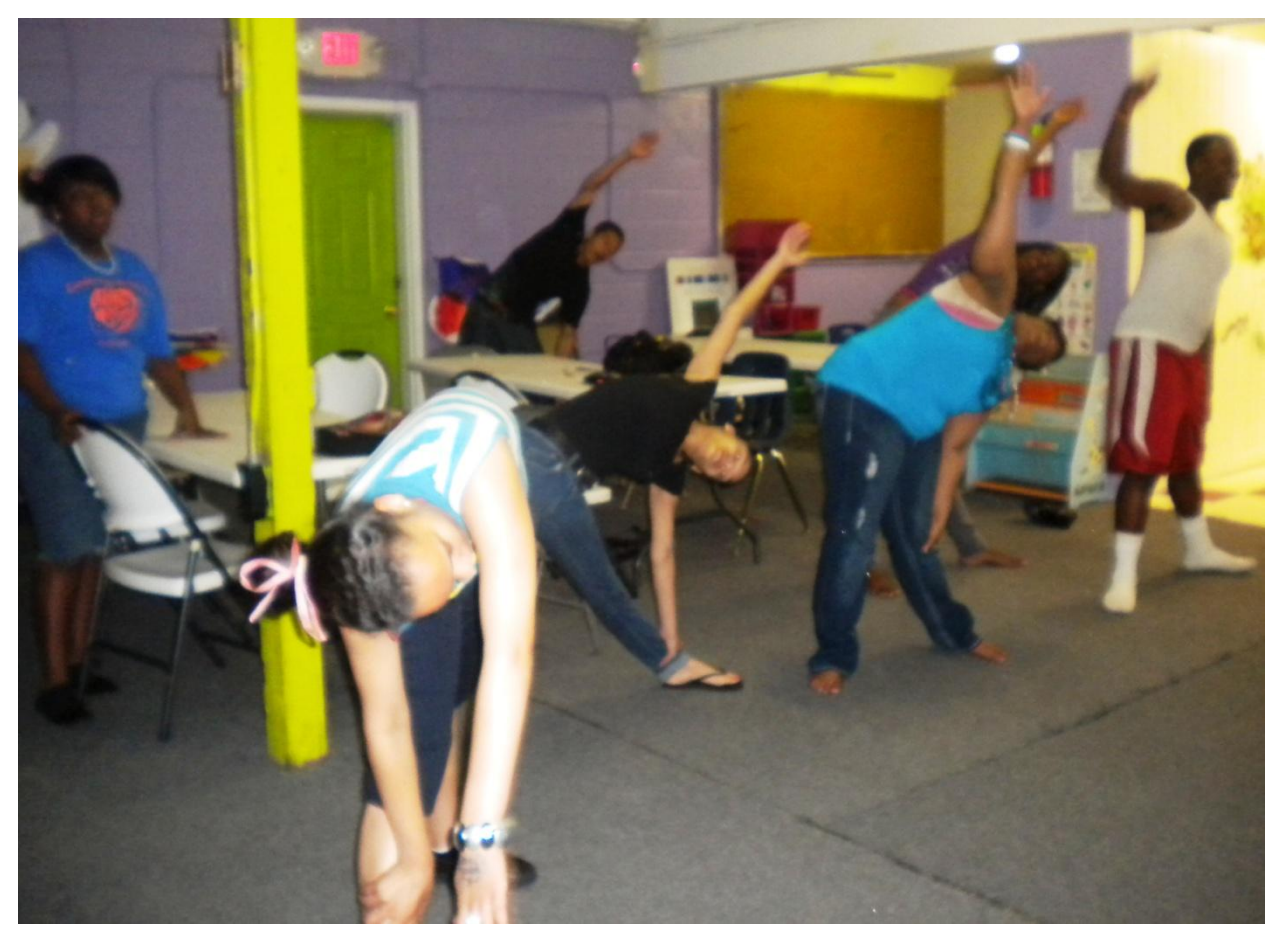
#9 – Student exercise class