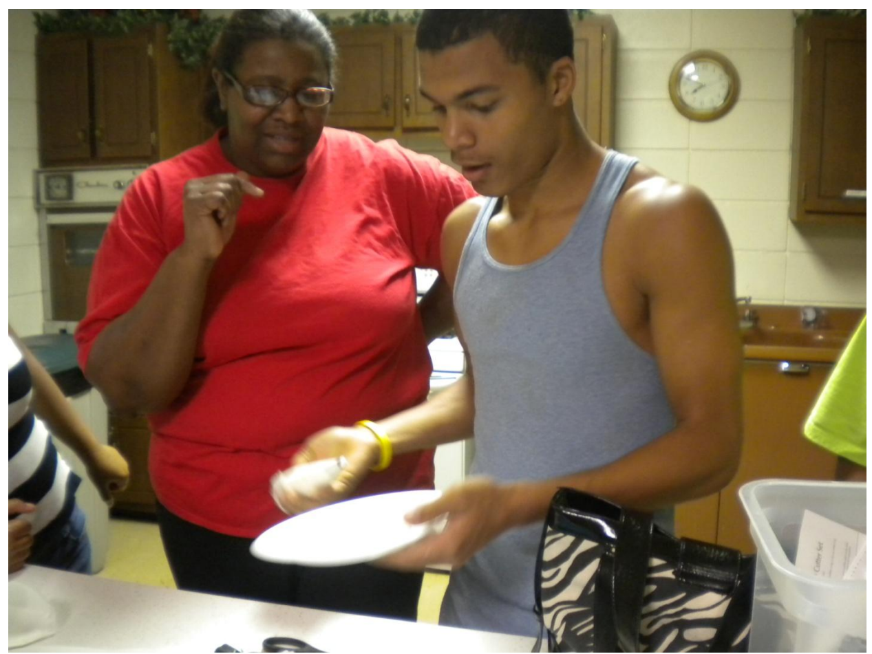
16 - Cooking class